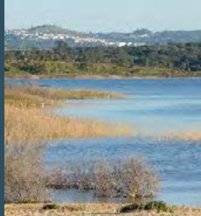
Santo André Lagoon

The lagoons are of great biological importance, attracting numerous birds and it is common to find concentrations of waterfowl, including the nightingale, which is the symbol of the reserve. In terms of flora, this protected area is also very rich and diverse, with 510 identified plant species. Main beaches integrated in the area of the Natural Reserve: Costa de Santo André, Monte Velho, Fonte do Cortiço, Areias Brancas.